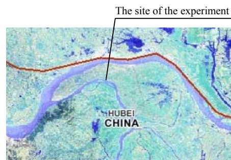
Figure 1. The location of the experiment in the satellite image.

Results of Segment 9 were shown in Figure 2. From image of contoured S-wave velocities (Figure 2a) a lower velocity zone appears in area between station K72000 and K70150 along profile. More than 25% drops in S-wave velocity relative to the background delineate the unconsolidated material in the depth of 10-25 m below the surface of the dike. The resistivity image (Figure 2b) gives correlative signals around the lower S-wave velocity zone shown Figure 2a. The zone of lower resistivity was interpreted the indication to higher moisture within the dike. Imaged potential leak factor shown in Figure 2c are calculated based on k_V=80 and k_R=5 . A critical value of the potential leak factor ( F ) can be determined by analyzing and comparing entire measurement. For this experiment, the critical value was determined as 1.8. The zone circled by the contour lines at the critical